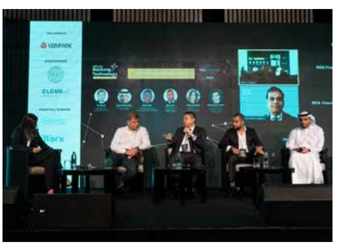
Panel 3: Open Banking & New Business Models