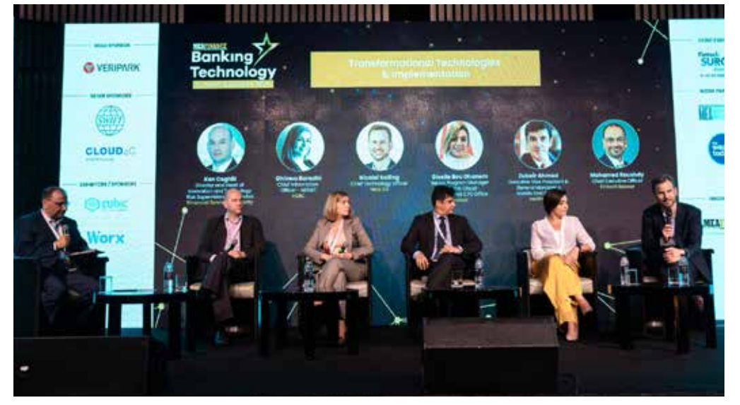
Panel 5: Transformational Technologies & Implementation